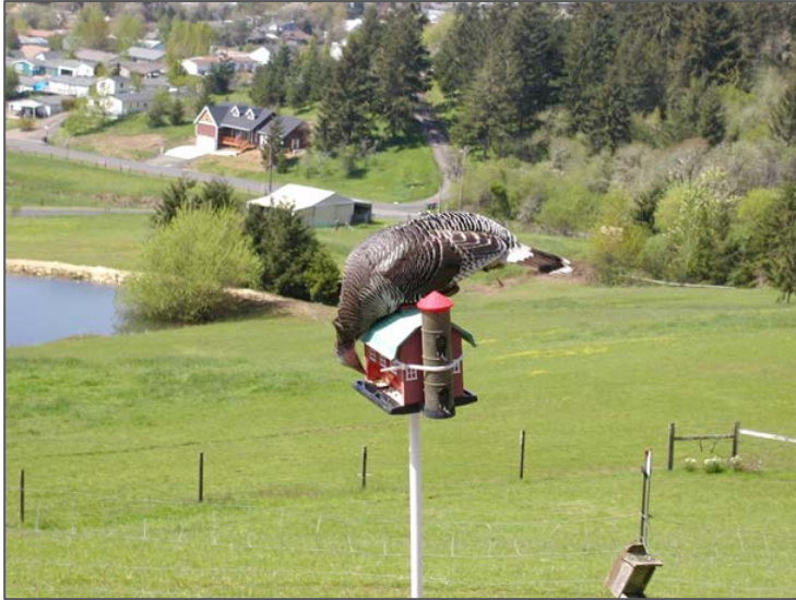
Figure 7. Resourceful turkey hen feeding on songbird food in elevated bird feeder in Yamhill County, Oregon.

Each year, ODFW receives complaints about nuisance turkeys from agricultural producers, homeowners, and other land managers, and seeking information on how to alleviate various issues. Complaints received by ODFW are recorded in the Wildlife Damage Complaint database to track the number and type of complaints annually, as well as any actions taken. Based on the last three complete years of data (2015 – 2017)