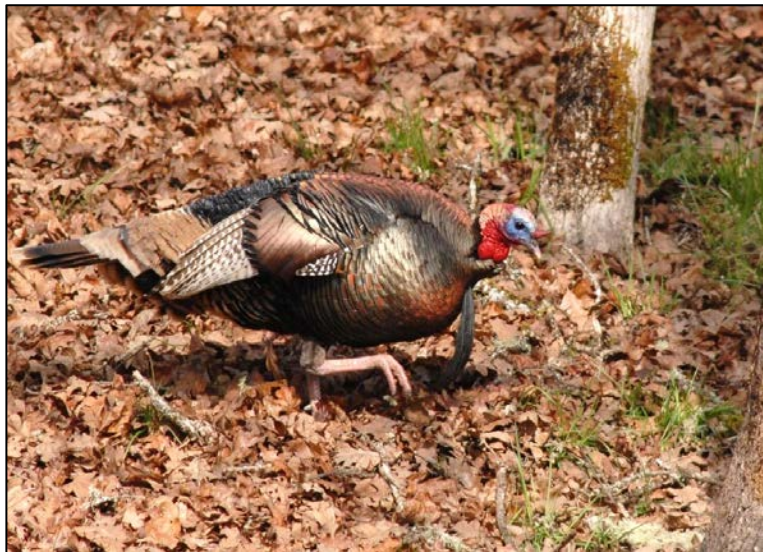
Figure 3. Turkeys often forage in Oregon white oak habitats with open understories.

Food Habits - The wild turkey is omnivorous consuming five major food categories including reproductive parts of plants (fruits and seeds), leaf material, simple flowers, underground vegetative structures, and animals (invertebrates and vertebrates). Mast is the primary food during fall and winter (Porter 1992:209). Food items include oak acorns, juniper berries ( Juniperus spp. ), pine seeds ( Pinus spp. ), skunkbush sumac ( Rhus trilobata ), kinnikinnick berries ( Arctostaphylos uva-ursi ), hawthorn ( Crataegus spp. ), snowberry ( Symphoricarpos spp. ), and wild rose ( Rosa spp. ). During the winter and early spring, wild turkeys feed mostly on herbaceous vegetation and mast, such as juniper and manzanita berries, pine seeds, plant seeds, grasses and green forbs. During the summer and early fall, turkeys feed on grasses, forbs, soft mast (manzanita and juniper) and hard mast (pine seeds and acorns). Insects are important in the summer months, especially for young birds, which depend on this high protein diet for growth and development. For the first week of life, approximately 80% of the poults' diet consists of insects. Adults also readily utilize insects when available. Litton (1977) documented annual food utilization of Rio Grande turkeys as 36% grasses, 19% browse, 16% forbs and 29% insects. However, turkey food utilization varies seasonally, annually, and regionally and many variables affect food availability (Bailey and Rinell 1968).