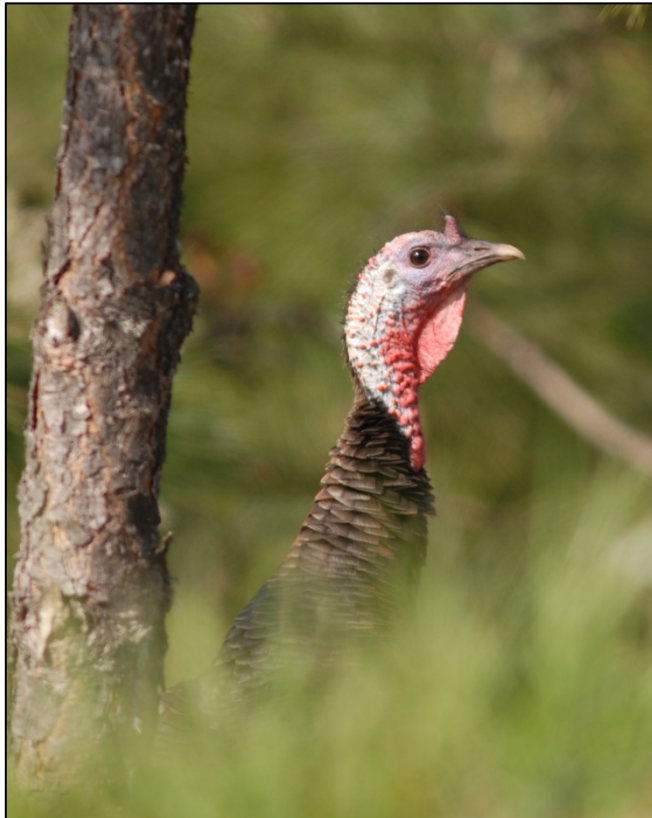
Figure 2. Turkeys are known for their keen eyesight, which makes hunting them a challenge.

Hunting – Due to the high annual survival rates of wild turkeys, mortality associated with spring hunting is generally considered to be additive (Vangilder 1992), and does not compensate for natural mortality in turkey populations. If managed properly, spring hunting typically does not have a long-term impact on population numbers (Vangilder 1992, Vangilder and Kurzejeski 1995). The length and timing of the spring