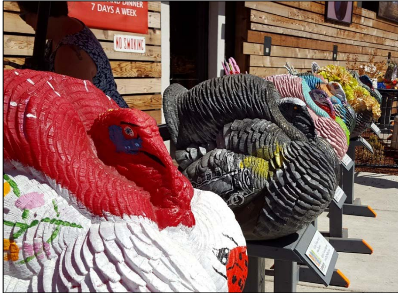
Figure 6. The City of Lebanon Arts Commission celebrates the fact that their city is known for turkeys with the Great Quirky Turkey Pageant.

As turkey distribution and populations increased nationally during the latter half of the 20 th century, turkey hunting became the fastest growing form of hunting. Turkey hunting remains extremely popular in many states, despite recent (2009 – 2014) nationwide declines in spring turkey hunting participation (-2.3%) and harvest (-5.8%)